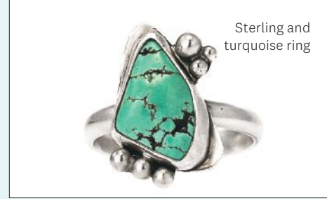
Sterling and turquoise ring